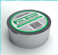
Silver FOILBOARD Joining Tape