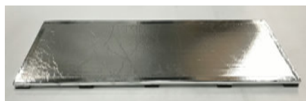
FOILBOARD Silver side with Taped Edge