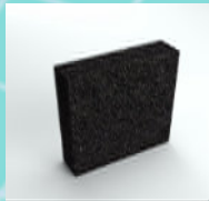
FOILBOARD Spacer Block